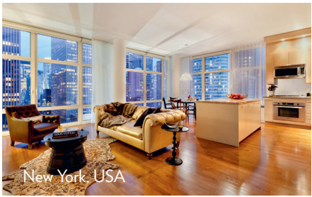
New York, USA