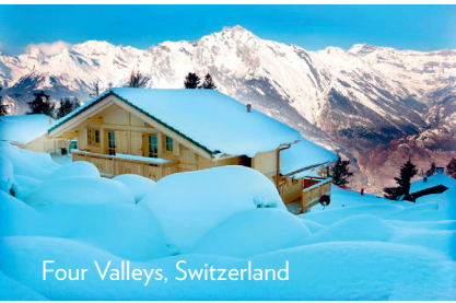
Four Valleys, Switzerland