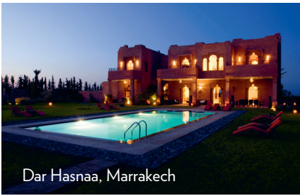
Dar Hasnaa, Marrakech

Investment in this scheme is restricted to certified high net worth individuals or sophisticated investors. Evidence of the certification will be required before detailed information can be provided to you. The price or value of, or income from, investments can fall as well as rise. This investment carries a risk to your capital and an investor may get back less than the sum invested. You may have difficulty selling this investment at a reasonable price and in some circumstances it may be difficult to sell at any price. Do not invest in this unless you have carefully thought about whether you can afford it and whether it is right for you. This financial promotion has been approved for the purposes of Section 21 Financial Services and Markets Act 2000 in the United Kingdom by Smith & Williamson Corporate Finance Limited, 25 Moorgate, London EC2R 6AY, which is authorised and regulated by the Financial Conduct Authority.