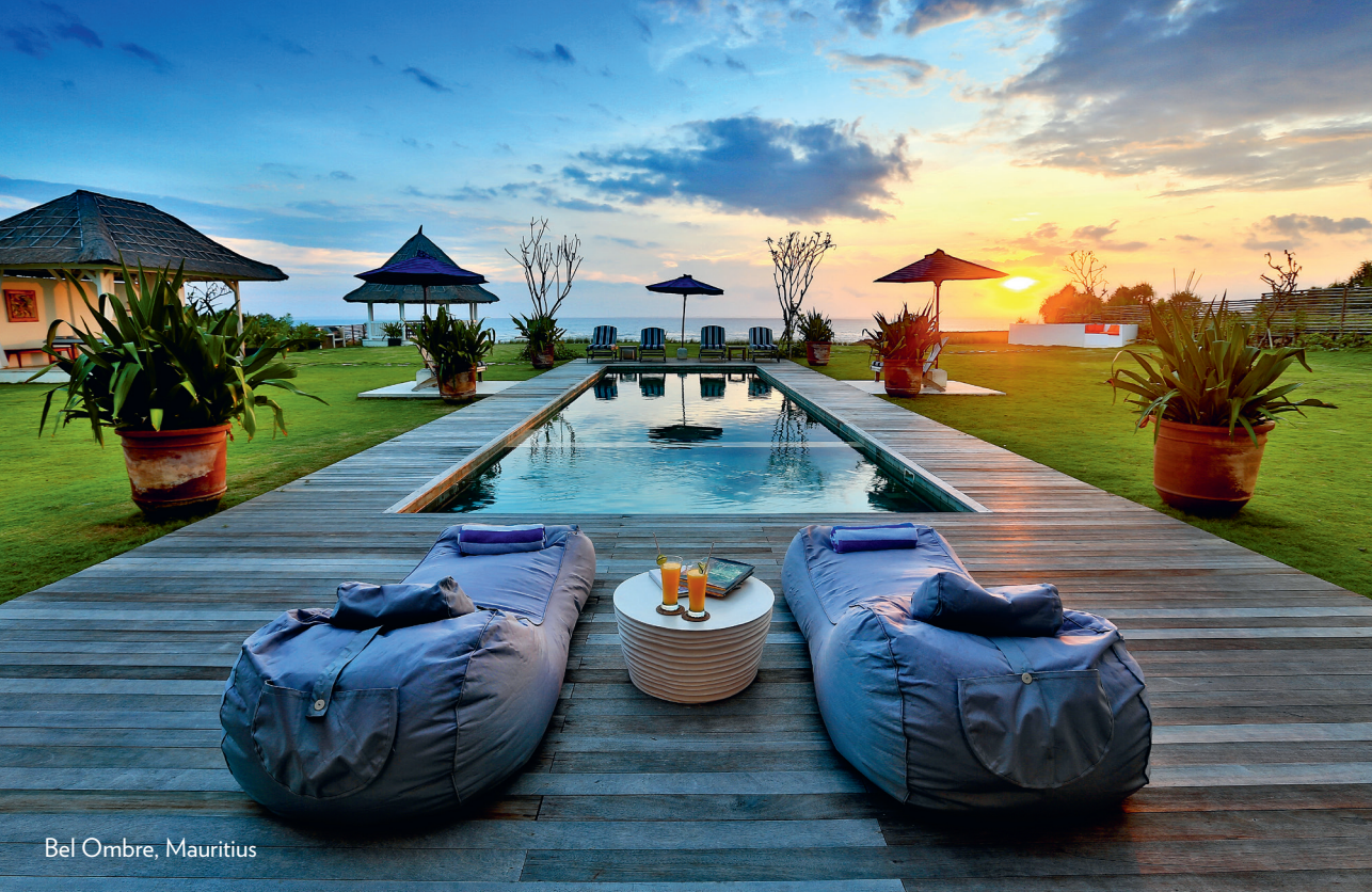
Bel Ombre, Mauritius